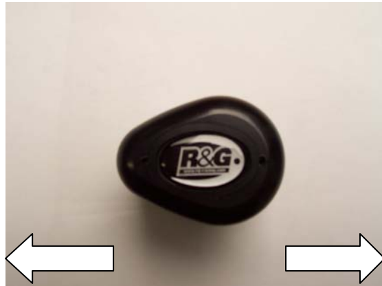
REAR OF BIKE