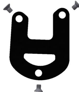
CLAMP PLATE AND BOLTS