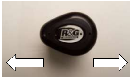
REAR OF BIKE