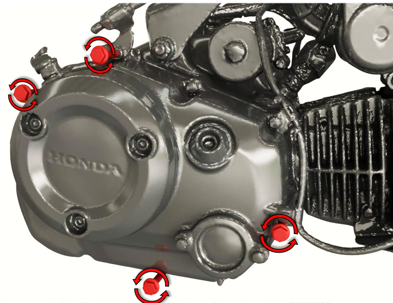
SCHÉMA DE MONTAGE 1